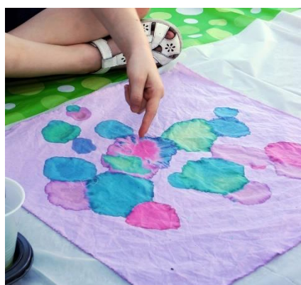
Red Cabbage Color changes with pH